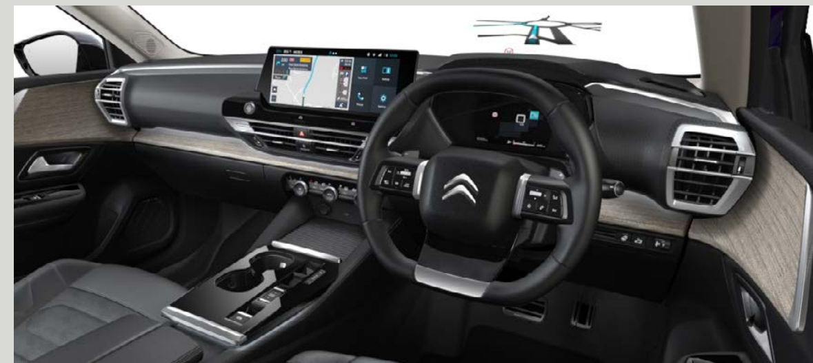
Hype Adamantium ambience Optional on MAX.