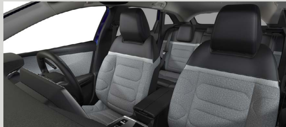
Urban Grey ambience Standard on YOU!