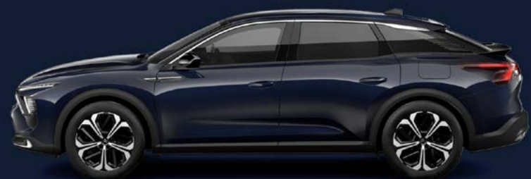
Eclipse Blue (M)