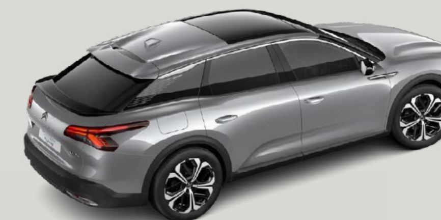
Opening panoramic roof with sunblind