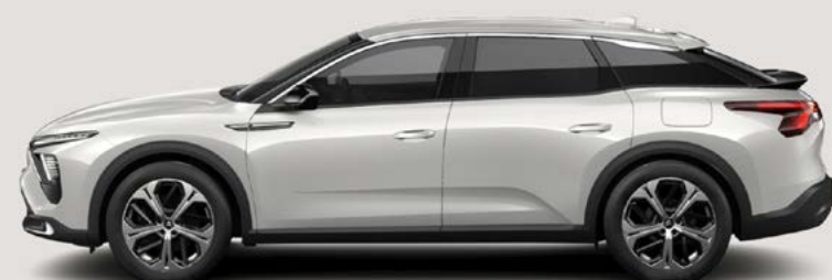
Pearl White (P)