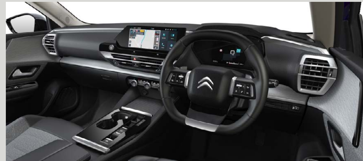
Metropolitan Grey ambience Standard on PLUS.