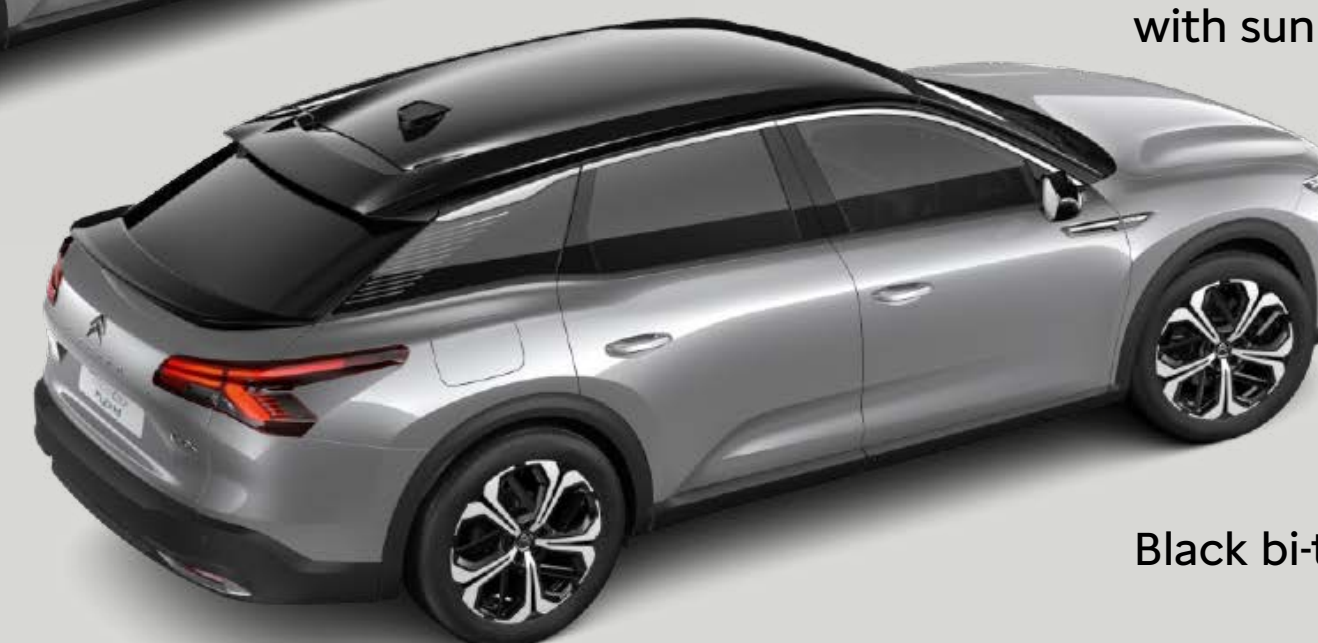
Black bi-tone roof