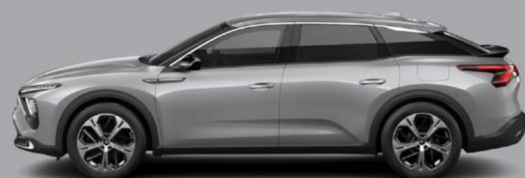
Cumulus Grey (M)